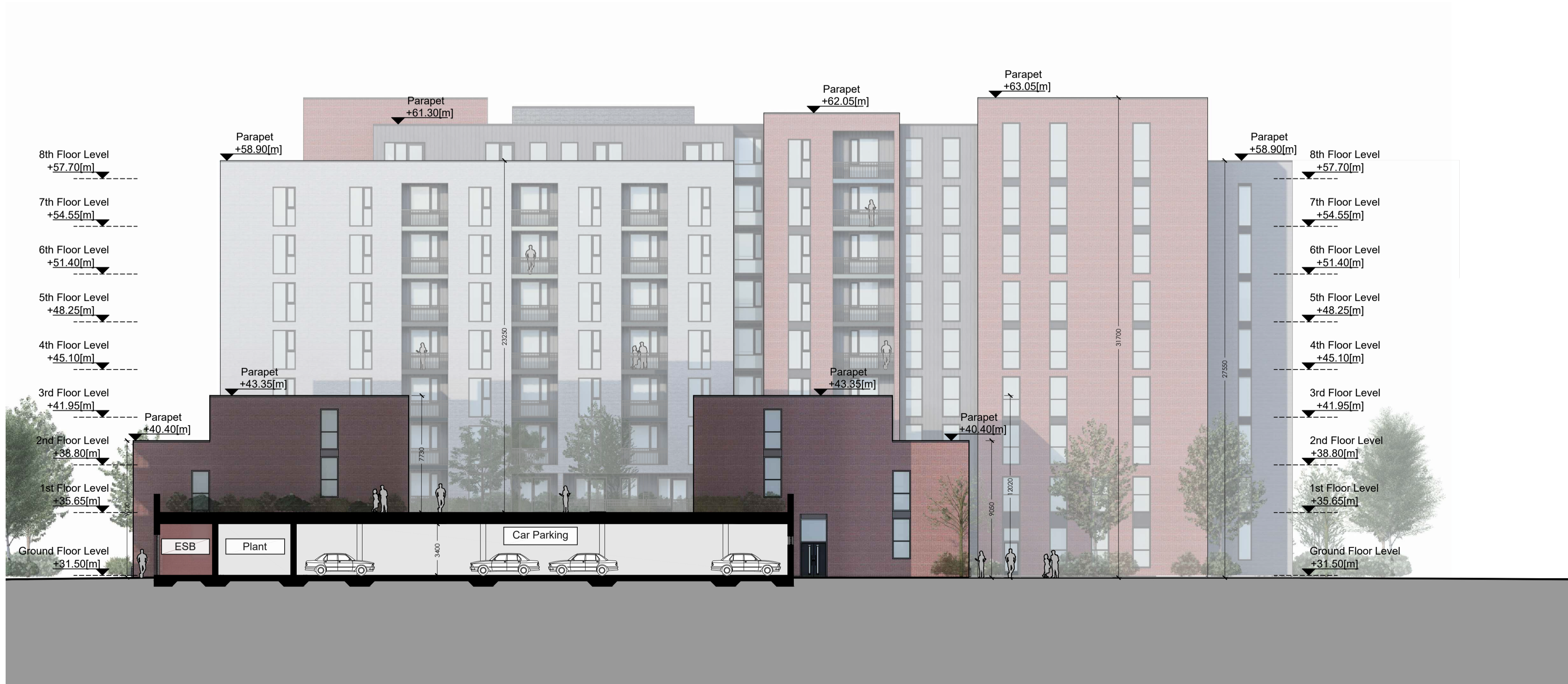
Section BB - Block 2 Scale 1:200 @A1