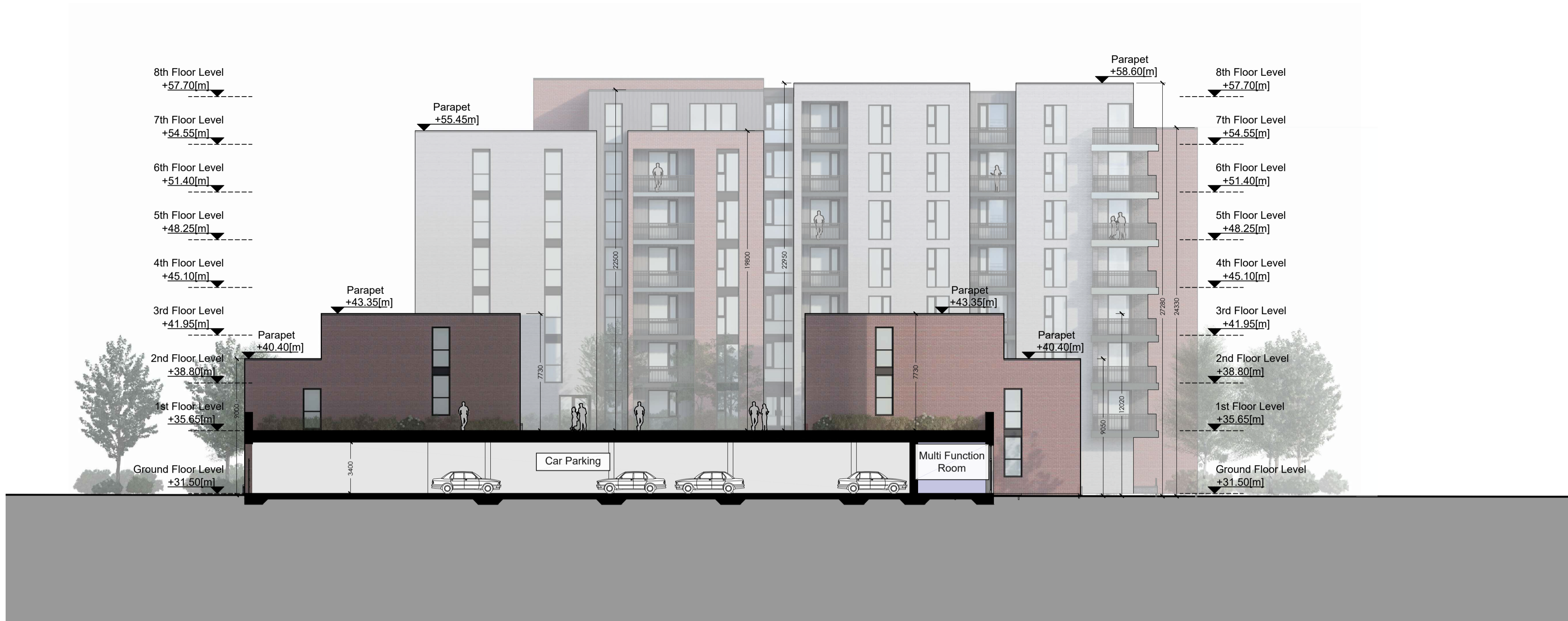
Section AA - Block 2 Scale 1:200 @A1